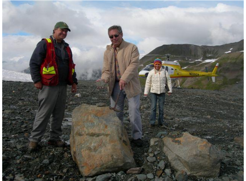
Massive sulphide boulders at the Mount Henry Clay prospect.